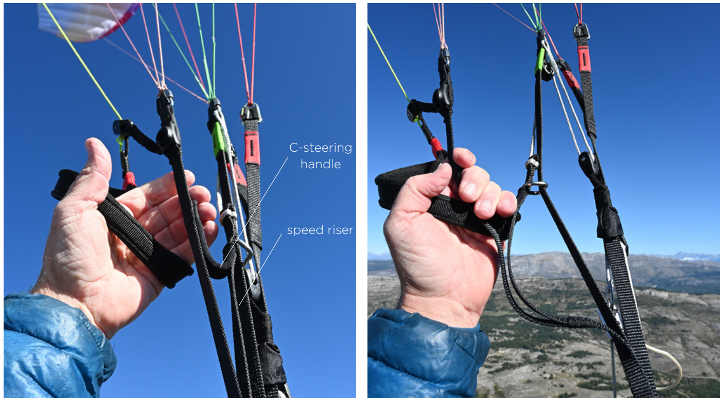
FIG. 1: Keeping the brake in your hand, grasp the C-steering handle with your fingers