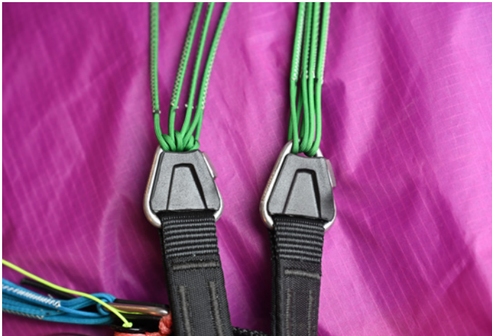
Left: loops on maillons; Right: loops released

All BGD gliders are rigged from new with loops on the maillons of the C lines (and D lines if any) plus the stabi line. The loops are there so that they can be released to compensate for any shrinkage of the back lines as the glider gets older.